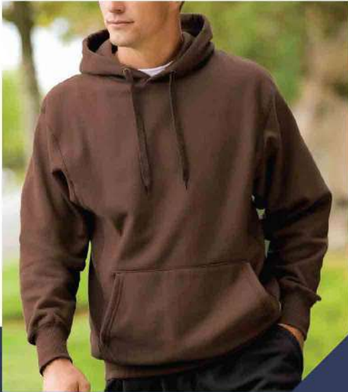
HOSIERY/ KNITTED GARMENTS